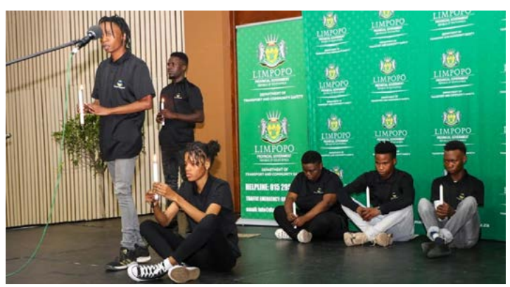
Drama for Change, The Impact Catalyst performing on stage.