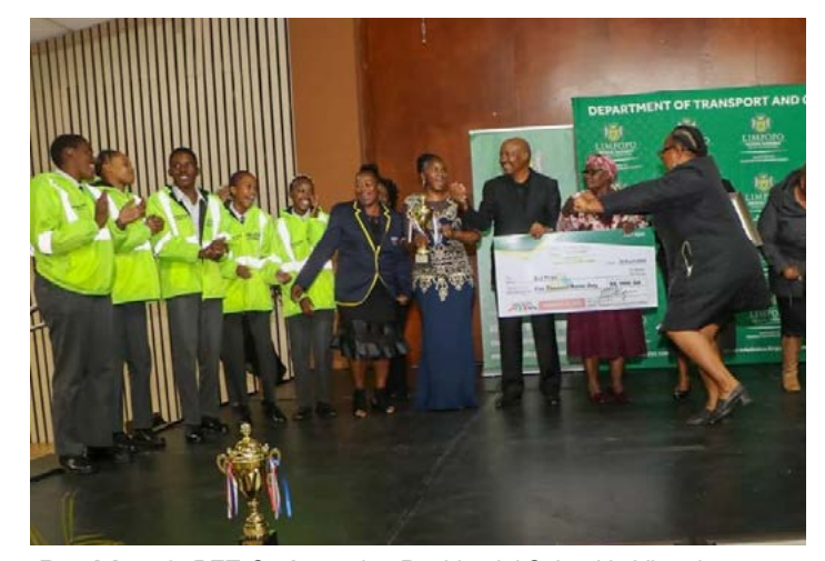
Position 2: PET, St. Augustine Residential School in Vhembe District.

We applaud learners who came out as winners during the prize giving ceremony. Some will move on to represent Limpopo at national competitions.