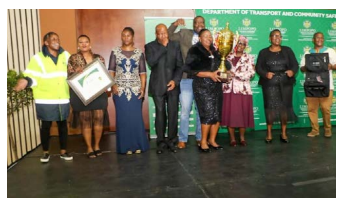
Capricorn District celebrating Position 1 for Rural Debate on stage.