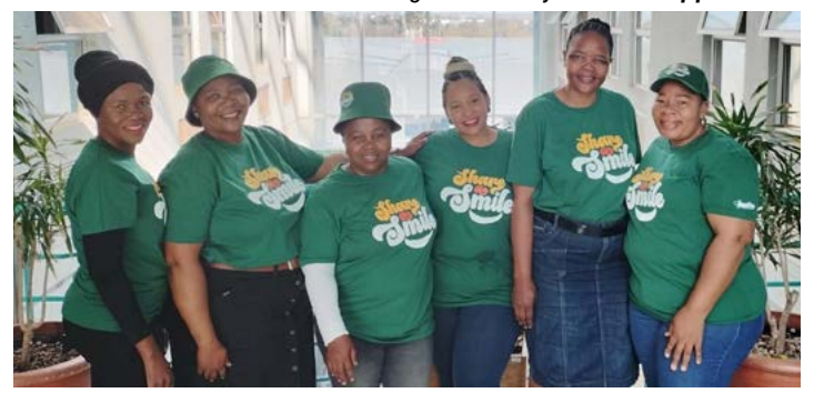
LDTCS Capricorn District observing Casual Day.