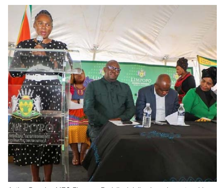
Acting Premier, MEC Florence Radzilani delivering a keynote address at Women's Day Celebration.