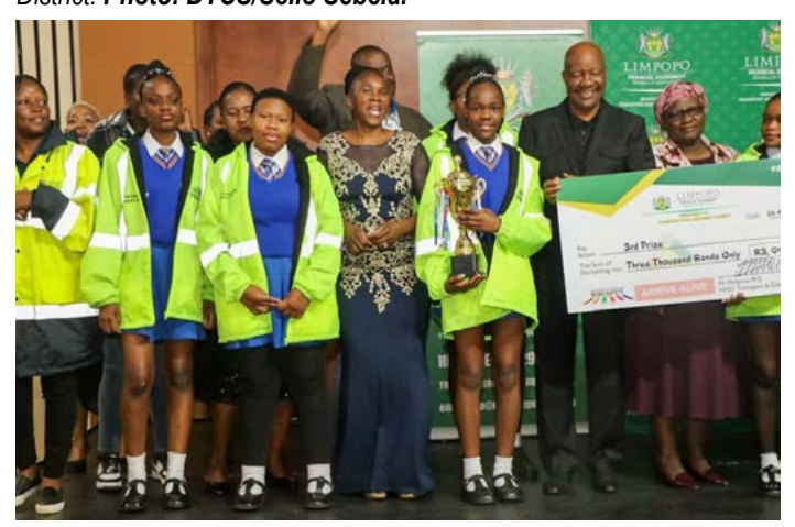
Position 3: PET, S J van der Merwe Secondary School in Capricorn District.